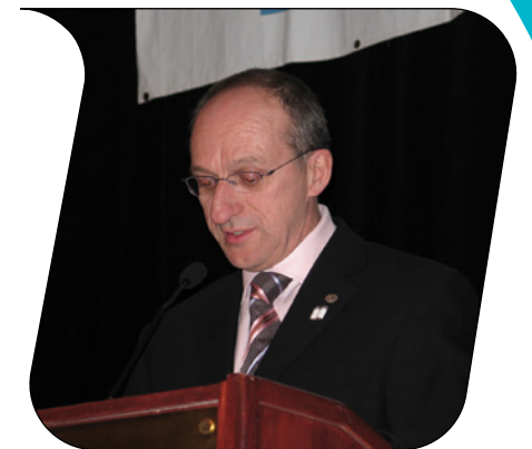
Yvon Vallières, Minister for MAPAQ, announcing the launching of Valacta, the Quebec dairy production centre of expertise, at the General Meeting of FPLQ, April 12, 2006.

* Programme d'analyse des troupeaux laitiers du Québec